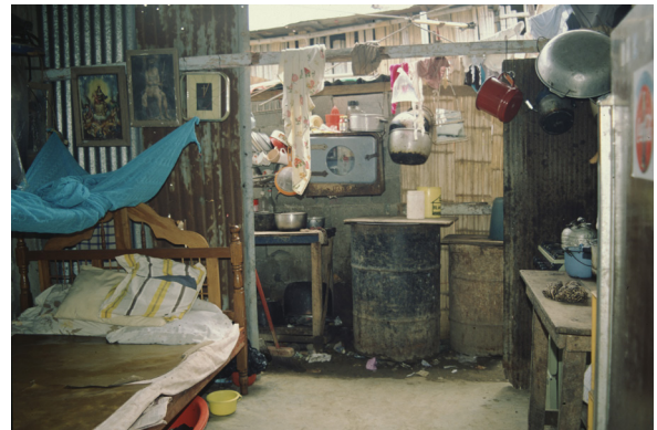
14. Interior of informal home (shown in previous image) built on stilts over the water. Santiago de Guayaquil, Ecuador, 1999.