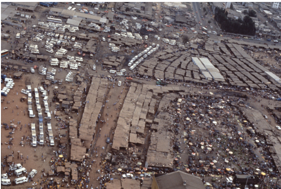
1. Aerial view of a dense informal market. Transport nodes and markets are often together. Abidjan, Côte d'Ivoire, 1991.

To complement the 'Understanding Informal Settlements and Slum Upgrading' Study Guide this curated, photo gallery (also available online here ) showcases the rich diversity of contexts and typologies of informal settlements captured in the I2UD archive. Spanning eight countries and twelve cities, these images offer a vivid portrayal of urban life, from sprawling panoramas of informal housing clusters to intimate street scenes and home interiors. These images highlight the complexities and nuances of informal urbanization.