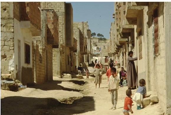
5. Streetview of Bab Siffer settlement. Fes, Morocco, 1987.