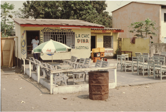
7. Large restaurant and informal gathering space in Kinshasa. Kinshasa, Democratic Republic of the Congo, 1989.