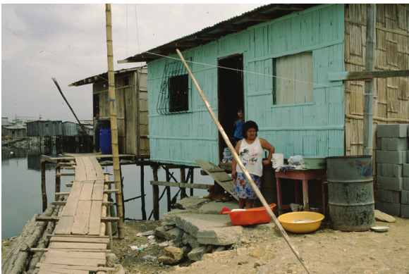
13. Informal home and toilet/bathhouse built over the water in Ecuador. Santiago de Guayaquil, Ecuador, 1999.