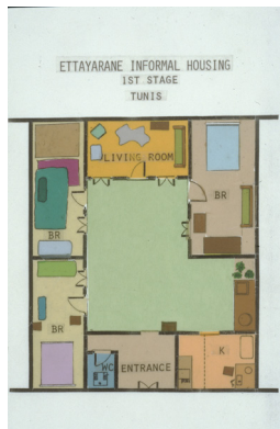
29. Example floor plan of structure built around internal courtyard in Tunis informal settlement. Tunis, Tunisia.