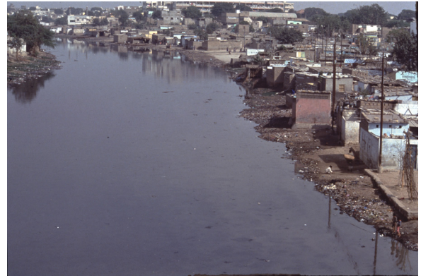
24. Informal development along the river in Karachi. Note the infilling of the waterfront land with solid waste. Karachi, Pakistan, 1993.