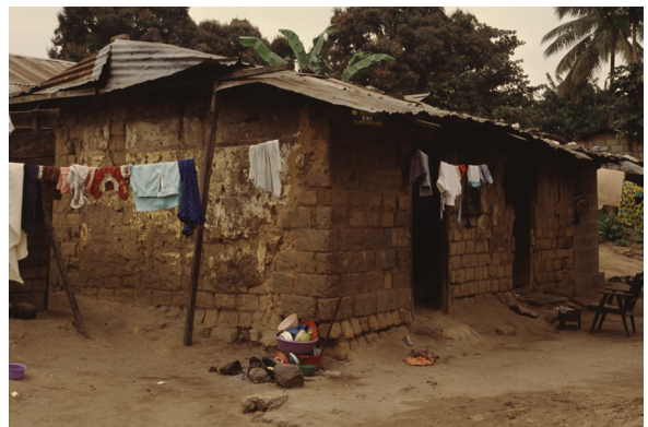
6. Housing built with mud brick. Kinshasa, Democratic Republic of the Congo, 1989.