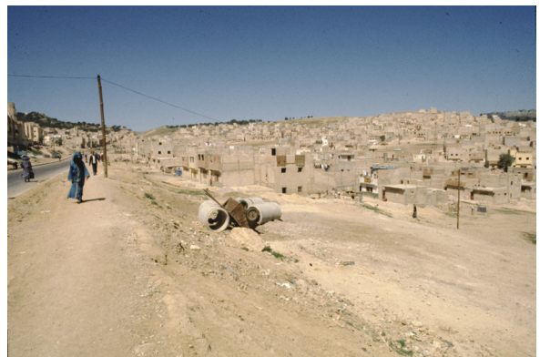
4. External view of Bab Siffer settlement in Fes. Fes, Morocco, 1987.