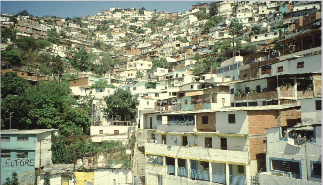
Caracas, Venezuela, 1990.