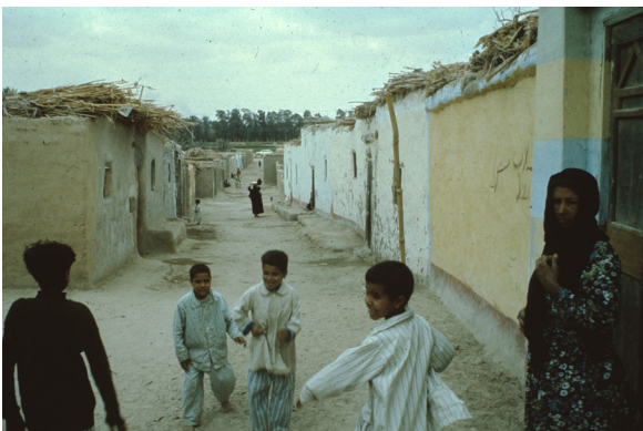
21. Peripheral area of Ghoneim informal settlement built out of mud bricks. Image showcases initial stage of lower density development. Helwan, Egypt, 1980-1982.