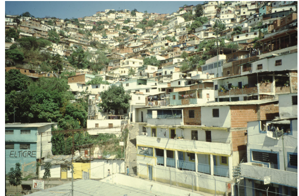
10. Informal settlement built up hillside. Note the informally constructed stairs and electrical infrastructure. Caracas, Venezuela, 1990.