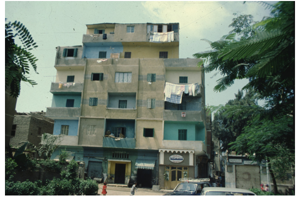
16. Informal high rise with ground-level shops and incremental rooftop construction in Ghoneim settlement. Helwan, Egypt, 1980-1982.