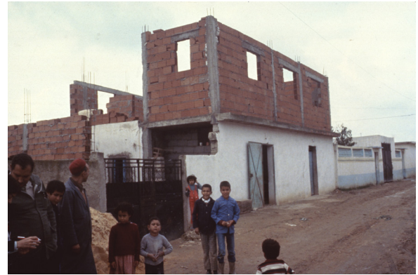
26. Housing being built incrementally along the road in Tunis. Tunis, Tunisia, circa 1984-1990.