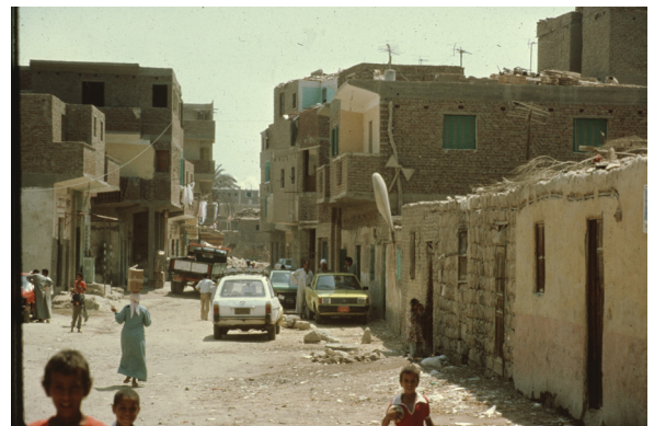
22. Bustling streetscape in Ghoneim informal settlement showing mixed use structures, multiple modes of transport, and incremental construction. Helwan, Egypt, 1986.