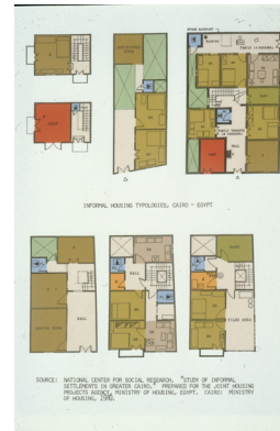
28. Floor plans of different types of informal settlement structures in Cairo. Cairo, Egypt.