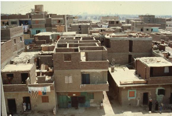
19. Bird's-eye view of Ghoneim settlement showing rapid growth and incremental construction. Helwan, Egypt, 1986.