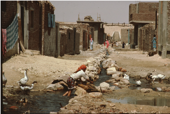
17. Drainage canals in Ghoneim settlement before upgrading. Helwan, Egypt, 1986.