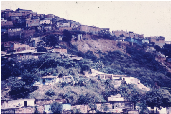
9. Dense informal settlement built up hillside. Note the high risk for landslide of many structures. Caracas, Venezuela, 1989-1995.