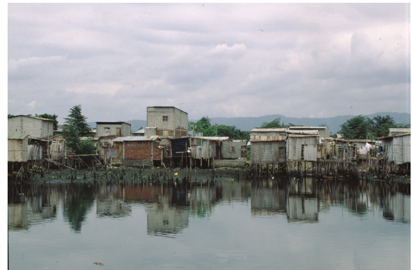
12. Informal settlement built along a river in Ecuador. Many structures are built on stilts over the water. Santiago de Guayaquil, Ecuador, 1999.