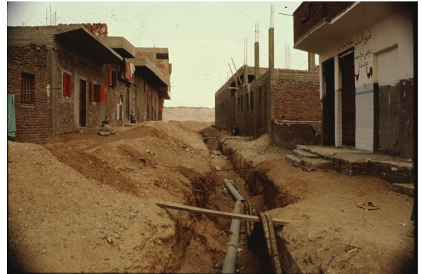
18. In-progress upgrading of drainage and electrical infrastructure in Ghoneim informal settlement. Helwan, Cairo, 1986.