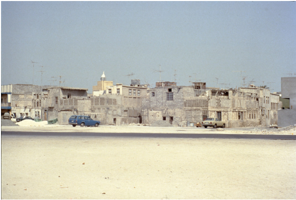
25. Informal housing showing incremental construction developed along the road in Muharraq. Muharraq, Bahrain.