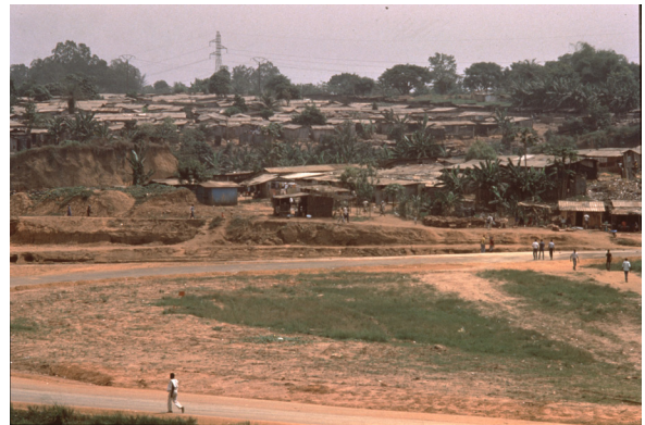
2. Informal settlement on the periphery of Abidjan. Abidjan, Côte d'Ivoire, 1991.