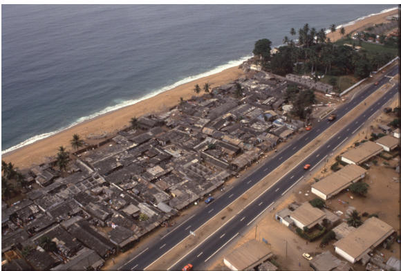
3. Aerial view of a dense informal settlement along Abidjan waterfront. Abidjan, Côte d'Ivoire, 1991.