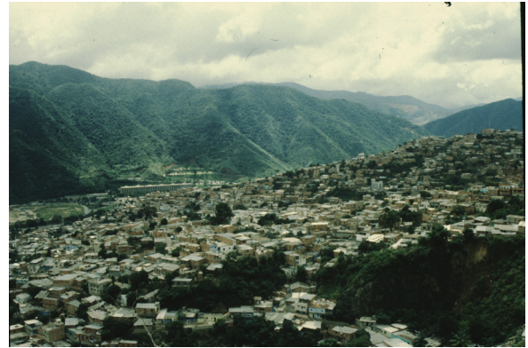
8. Bird's-eye view of informal development sprawling up the hillsides of Caracas. Caracas, Venezuela, 1989