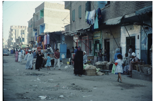
20. Bustling Cairo settlement streetscape with shops and mixed use. Cairo, Egypt, 1985.