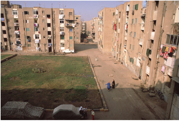
15. 5-story walk-up public housing in Cairo with large public spaces and courtyards. Cairo, Egypt, 1990.