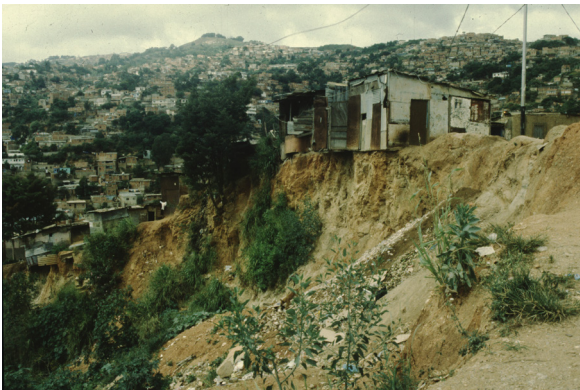
11. Structures built in precarious cliff side in Caracas at risk for landslides. Caracas, Venezuela, 1989.