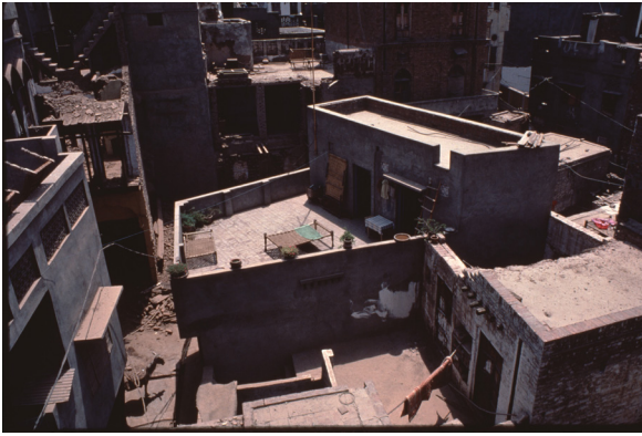
23. Bird's-eye view of roof tops of informal buildings in Lahore showcasing incremental construction and use of outside spaces. Lahore, Pakistan, 1982.